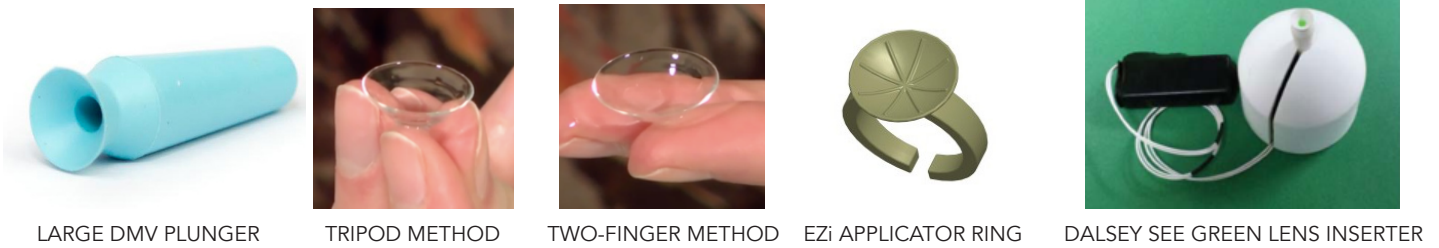
LARGE DMV PLUNGER TRIPOD METHOD TWO-FINGER METHOD EZI APPLICATOR RING DALSEY SEE GREEN LENS INSERTER